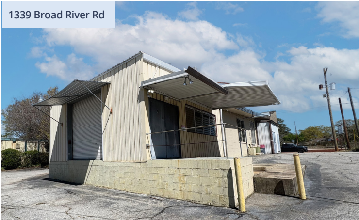
1339 Broad River Rd