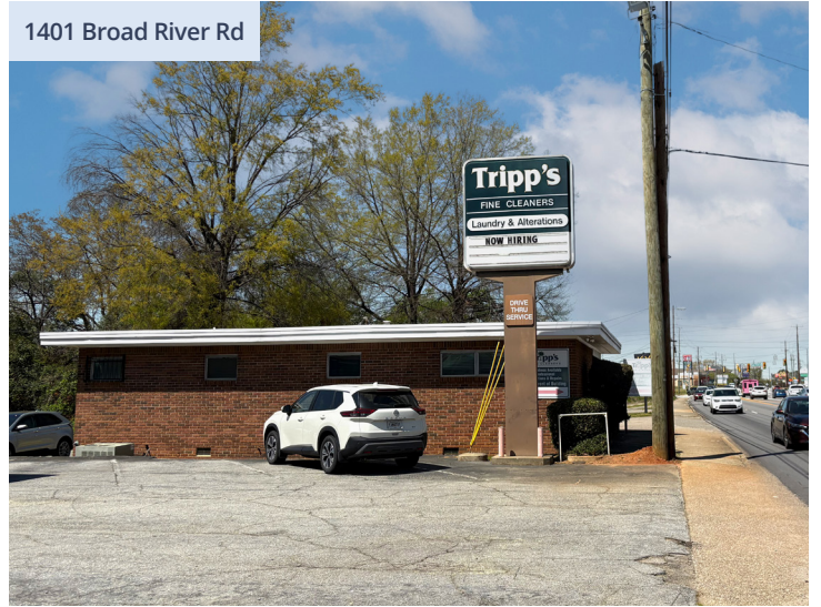
1401 Broad River Rd