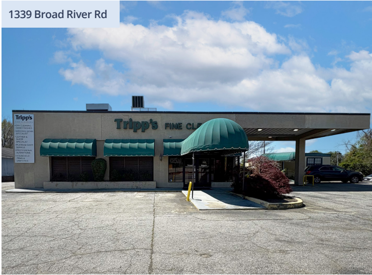
1339 Broad River Rd