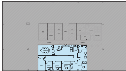
9 th Floor Overview