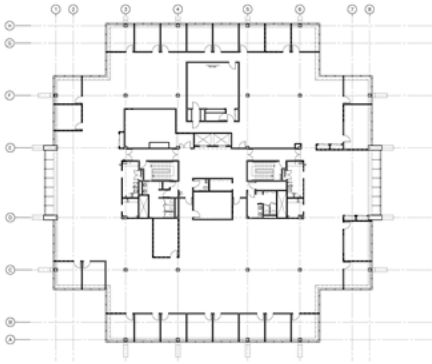
4th Floor "As-Built" | 19,400 SF