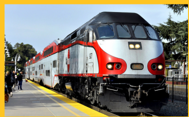
Walkable to Caltrain