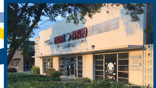
697 Veterans Boulevard