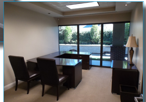
High-end finishes and professionally maintained