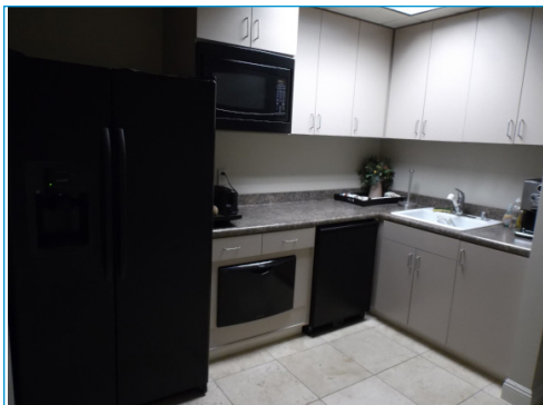
Common Areas: kitchen/breakroom and restrooms