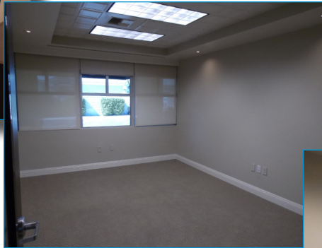
Quiet work environment