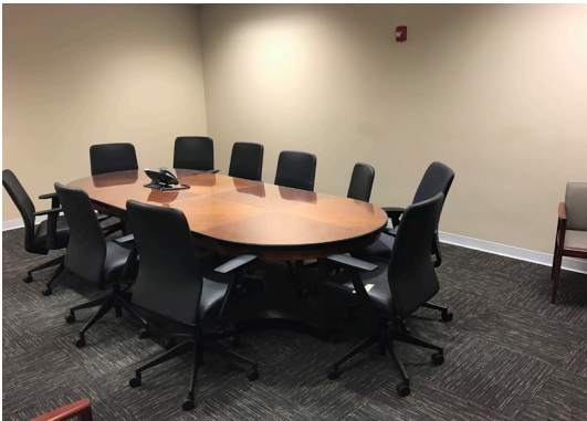
Existing Conference Room