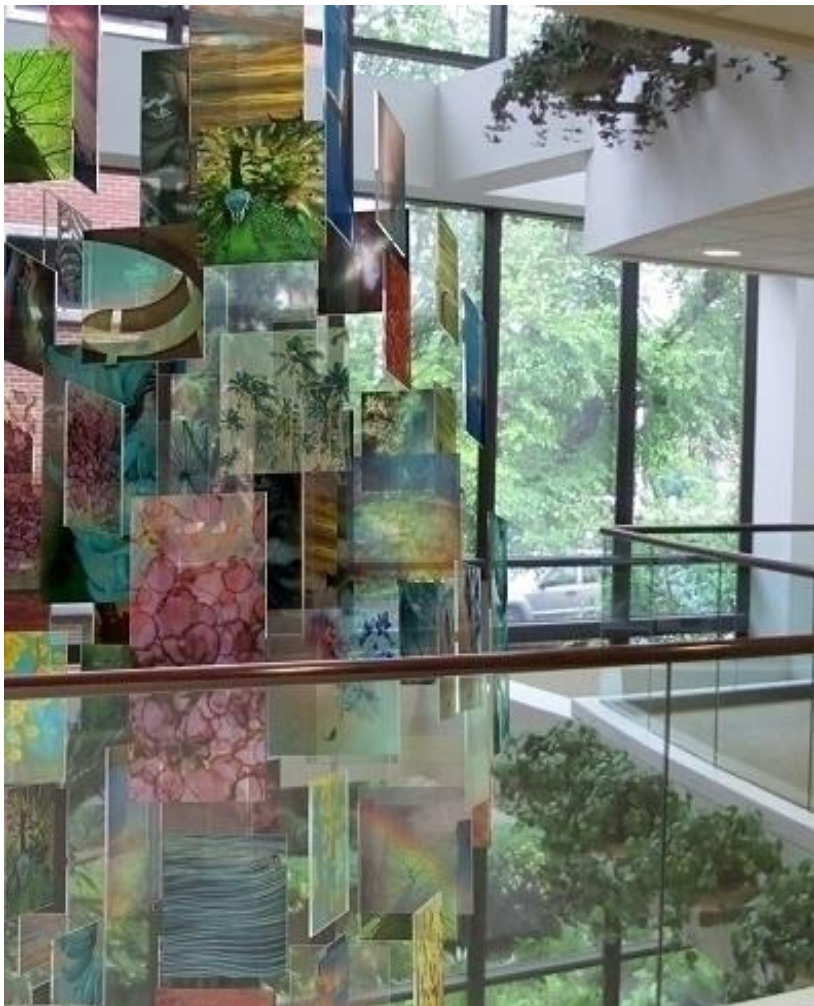
LOBBY ATRIUM – LIGHT SCULPTURE "PLANET EARTH"