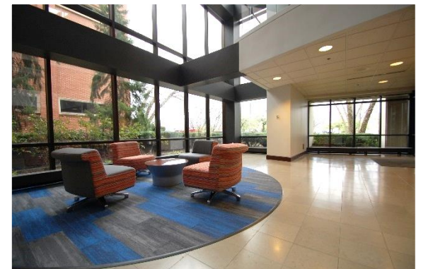
COMMON SITTING AREA