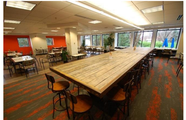
CAFÉ DINING AREA