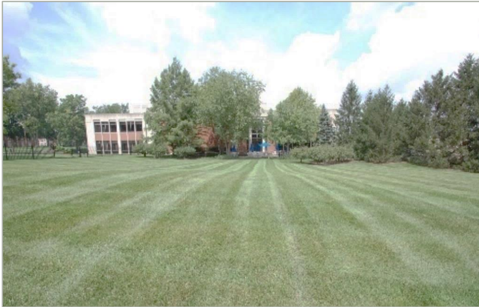
SOUTH LAWN – PATIO & RECREATION AREA