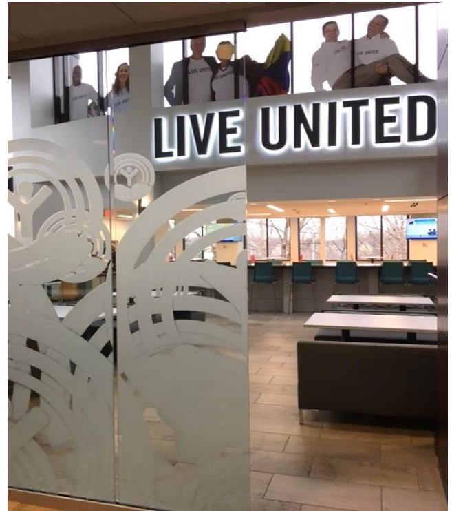
CUSTOMIZED TENANT COMMON AREA