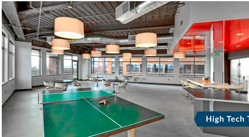
High Tech Tenant Spaces