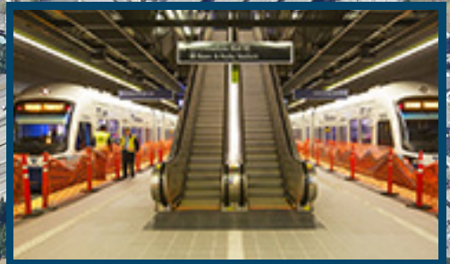
On-Site Transit HUB - Link Light Rail