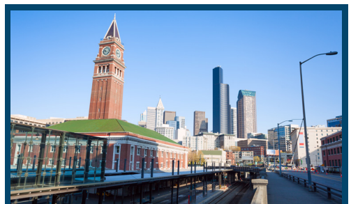
King Street Train Station