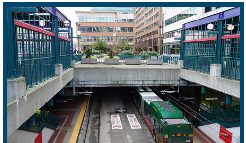
On-Site Transit HUB - Metro Buses