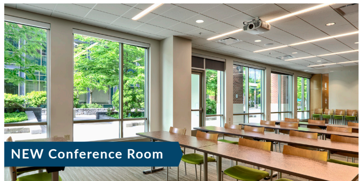
NEW Conference Room