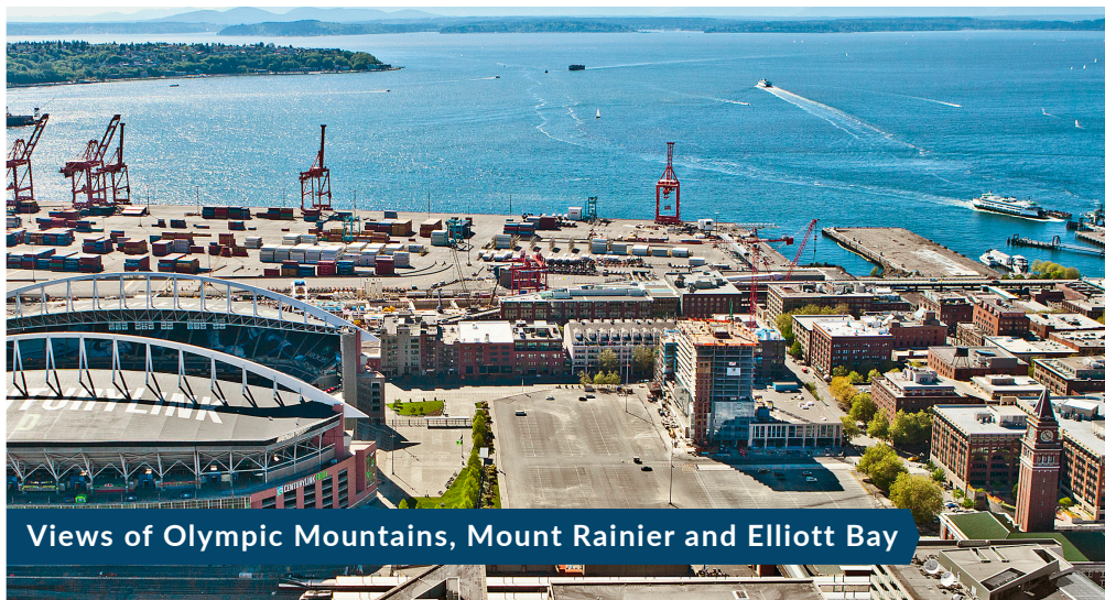
Views of Olympic Mountains, Mount Rainier and Elliott Bay