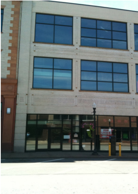
> Centrally located in business district