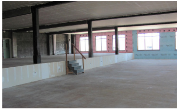
> Ample Natural Light and Open Space Design