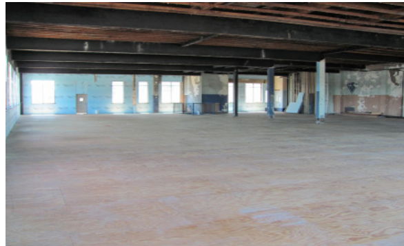
> Second/Third Floors 10,000 SF Each