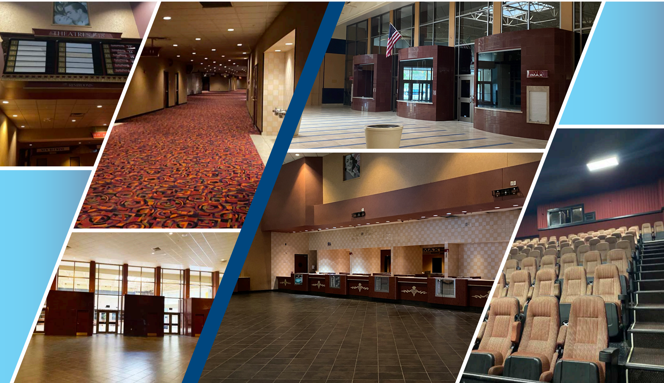
CLOCKWISE FROM TOP LEFT: "now playing" sign; hallway; box offices; exit theater doors to mall; box offices; movie theater auditorium.