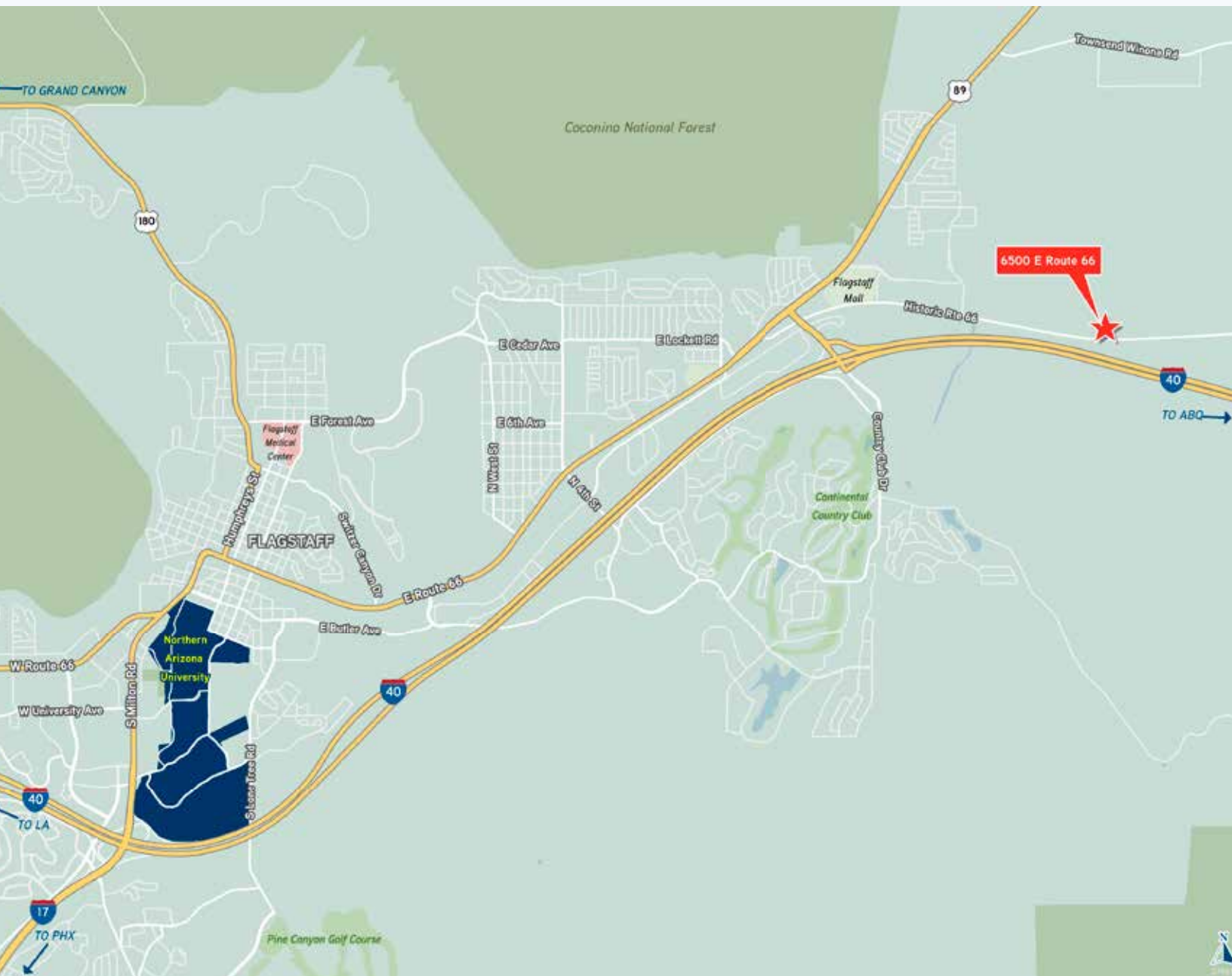
City of Flagstaff Map

FOR SALE | 6500 E. ROUTE 66 | Flagstaff | AZ