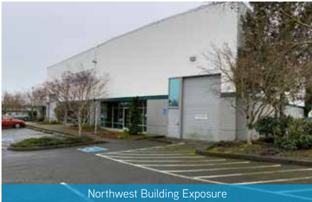
Northwest Building Exposure