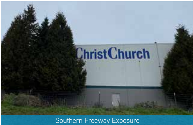
Southern Freeway Exposure