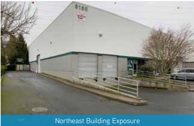
Northeast Building Exposure