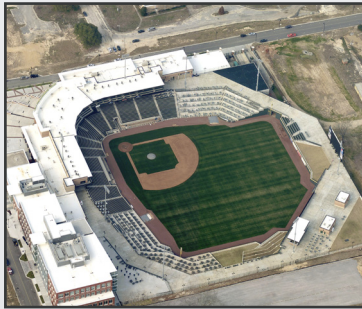
Spirit Communications Ball Park