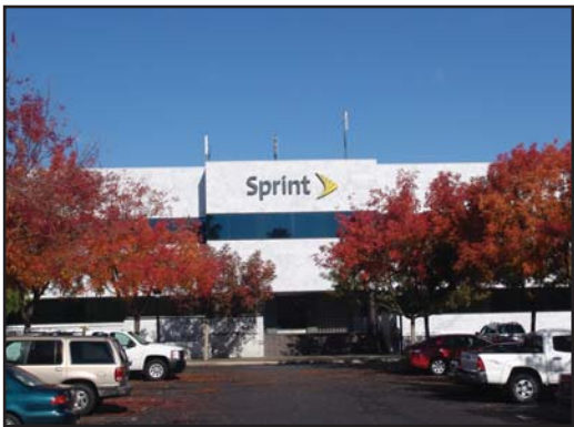
Corporate Offices in Mix