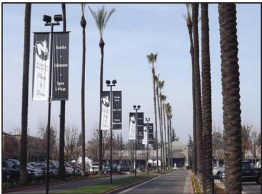
Grand Entry into Center