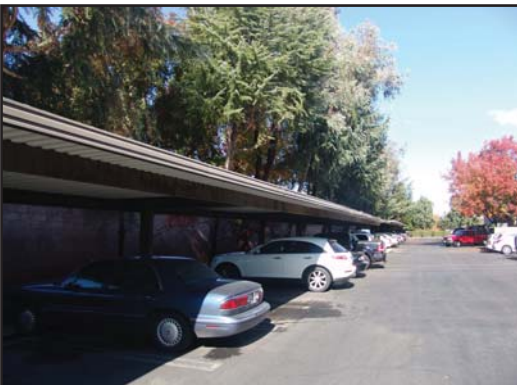
Rear Covered Employee Parking