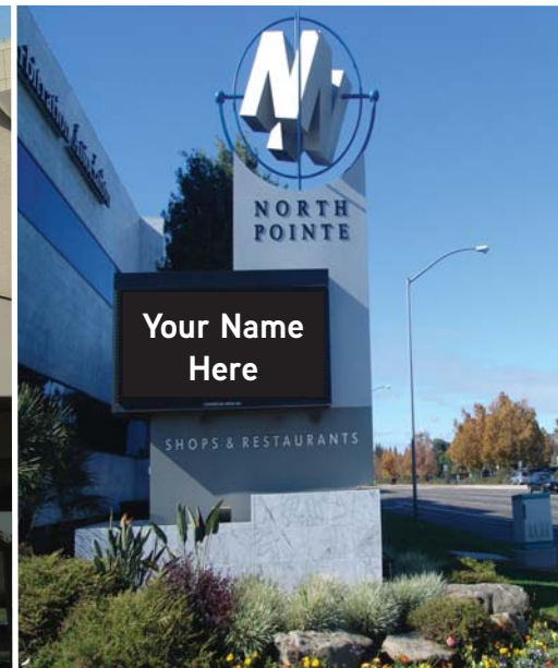
Herndon Ave. Digital Signage

(Tenant moving to smaller space in North Pointe)