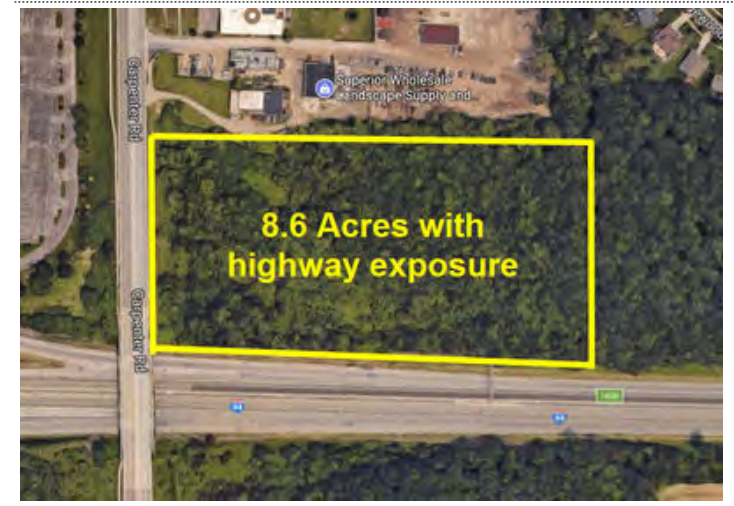
4251 Carpenter Aerial