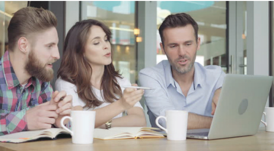
• Le Place Cafe