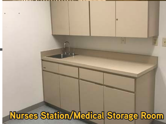
Nurses Station/Medical Storage Room