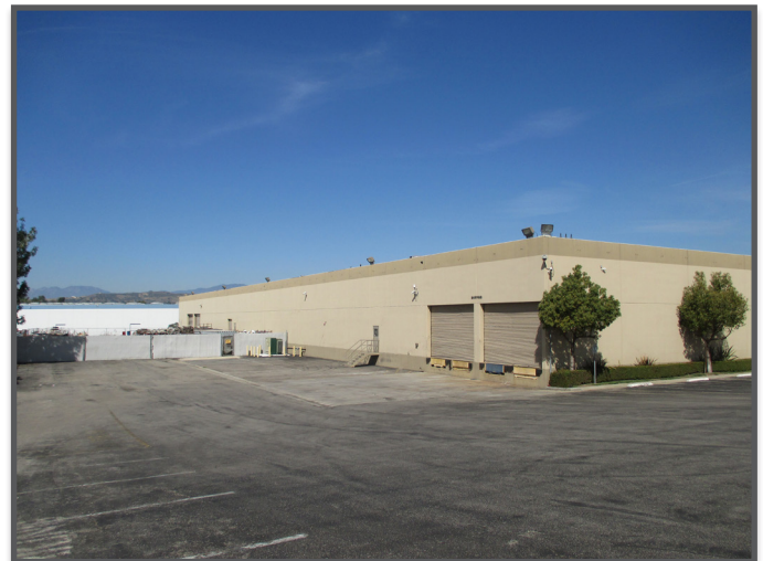
4 Docks Outside of The Fenced Yard (4 Dock Levelers)