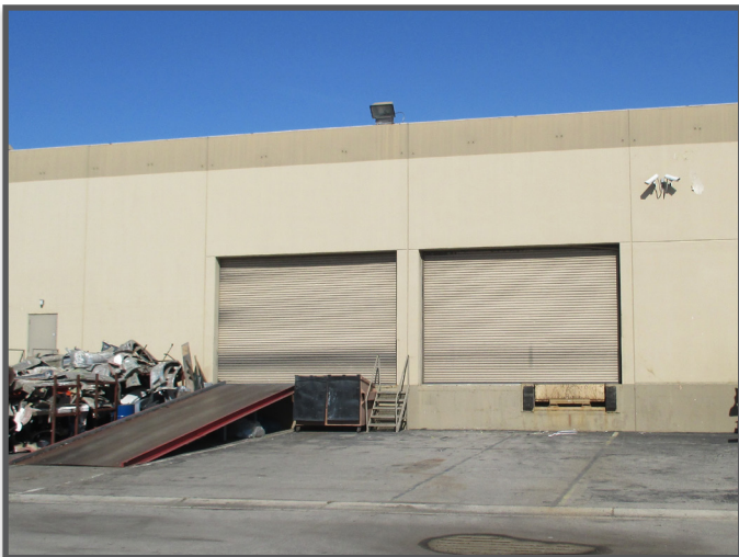
4 Docks Inside of The Fenced Yard (1 Dock Leveler + 1 Dock Ramp)