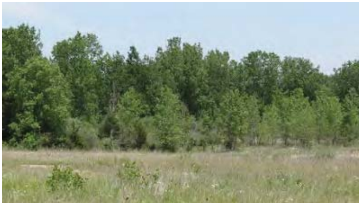
Plenty of Mature Trees