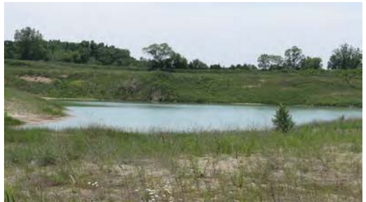
Two Ponds on Site