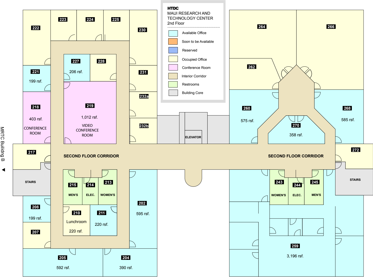
MAUI RESEARCH TECHNOLOGY CENTER Building A - Second Floor