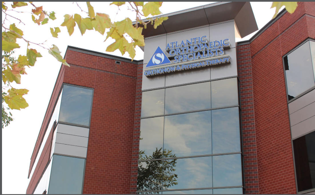
CLOCKWISE FROM TOP: Monument Signage // Lobby Area // Front of Office Building