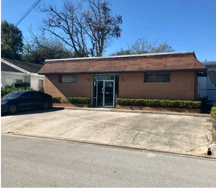
Front view of the building

1730 WESTCOTT STREET, JACKSONVILLE, FL 32206