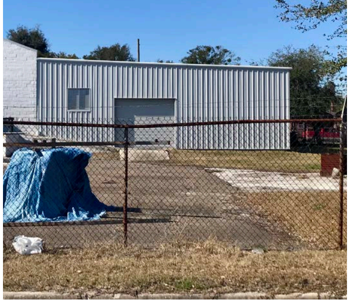
New building addition added in 2005