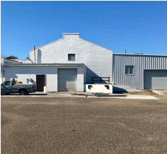
Truck court on Wescott Street