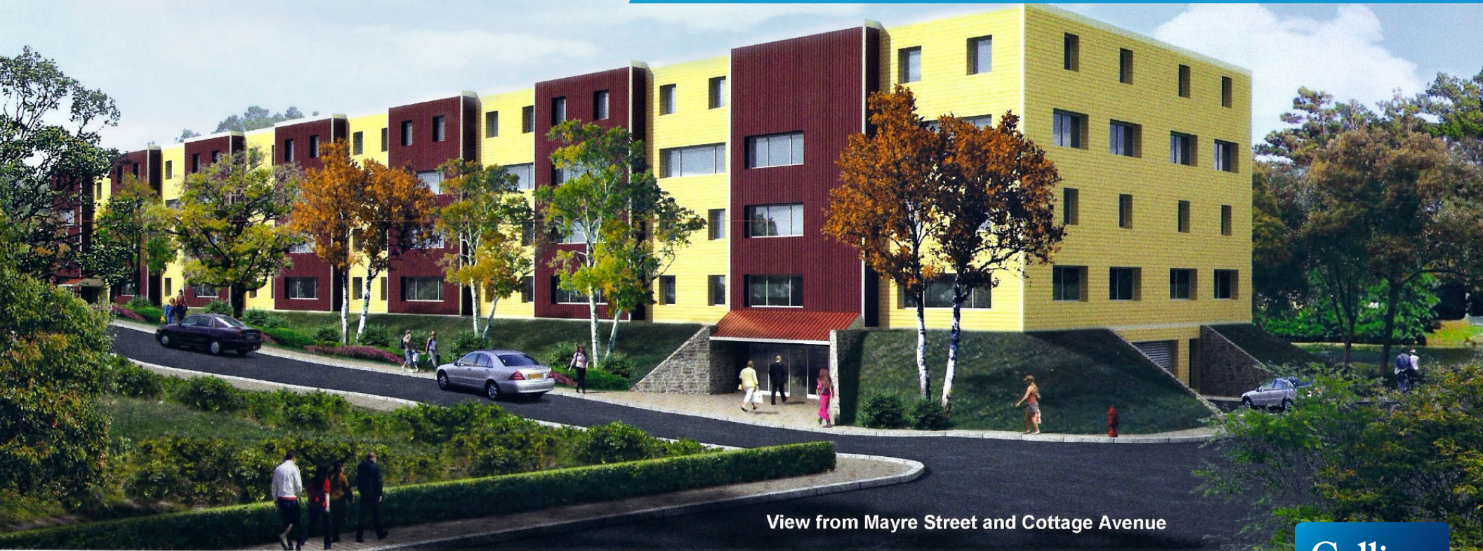
View from Mayre Street and Cottage Avenue

MIKE BRASS | 952 837 3054 | mike.brass@colliers.com