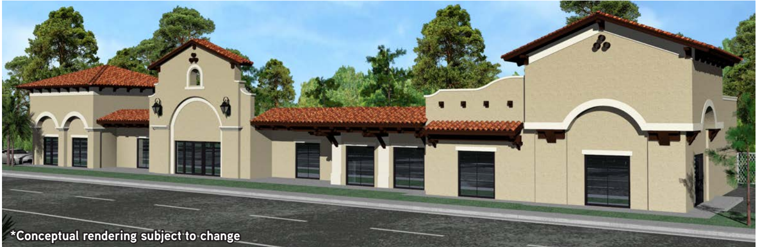
*Conceptual rendering subject to change