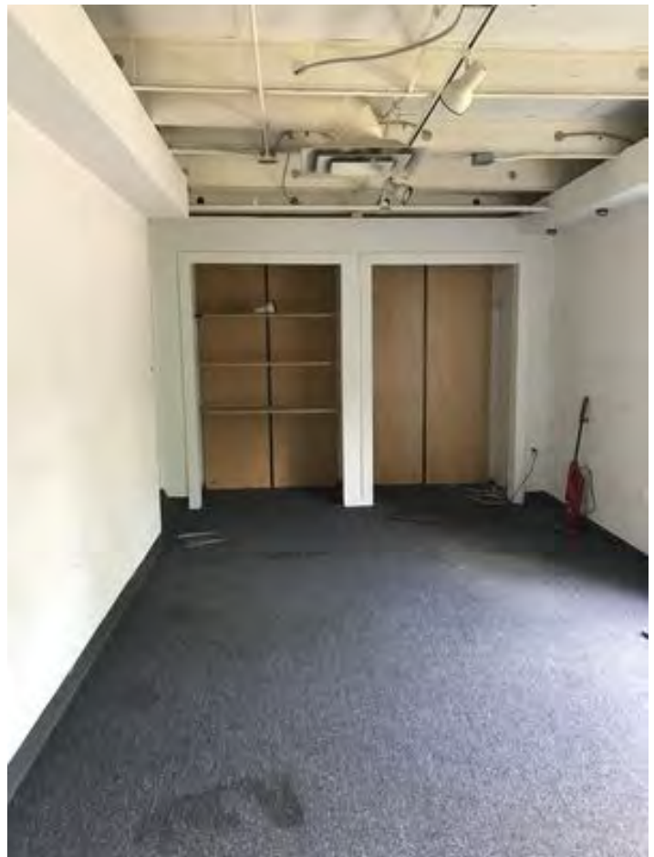
Suite 180 Interior 3