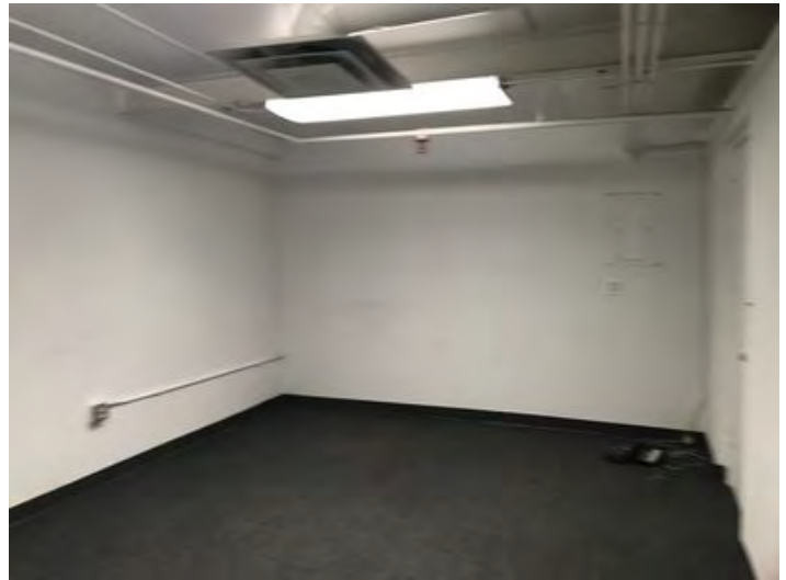
Suite 180 Interior 2