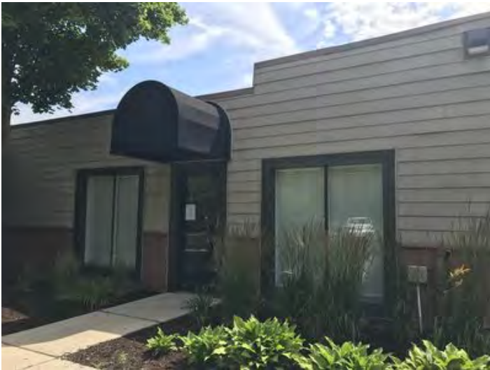
Suite 180 Entrance