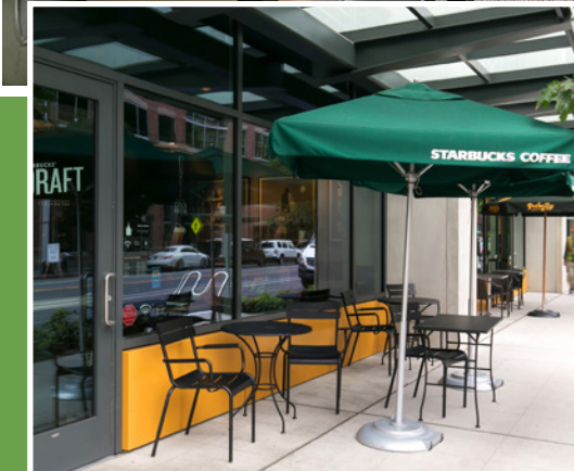
STARBUCKS ACROSS THE STREET