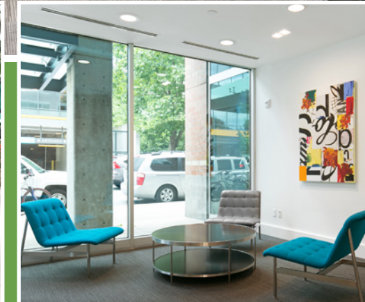
NEW 1100 DEXTER LOBBY