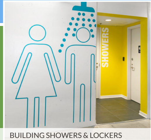
BUILDING SHOWERS & LOCKERS