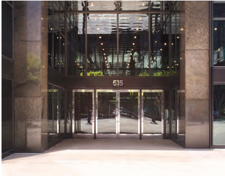
Exterior view of the lobby entry