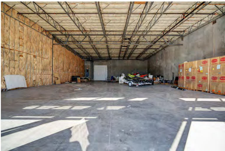
Suite 27 (Shell Condition)